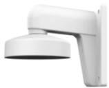
DS-1272ZJ-110-TRS Wall Mounting Bracket